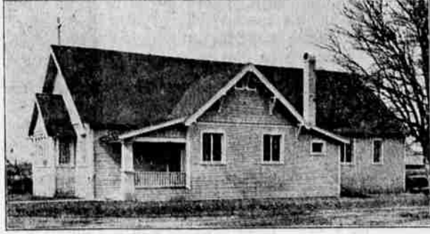
St. Mark's Parish House.