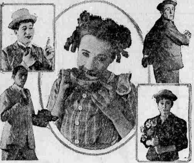
QUINTET OF FAMOUS COMEDIANS IN "QUINCY ADAMS SAWYER"