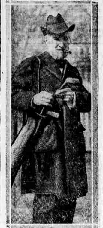
An exclusive photograph of Uncle Joe Cannon proving that the young man never grows old. The camera pictures, the grand old man of congress as a golf fan. Yes, he has fallen for the game and soon will meet all comers. It does not worry Uncle Joe a bit that he is only 86 years old. He carries his bag of sticks like a veteran of many an 18 hole campaign.