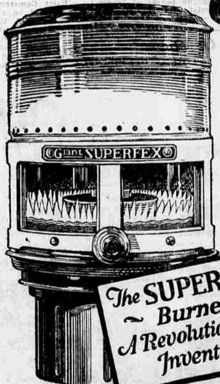
The SUPERFEX Burner A Revolutionizing Invention