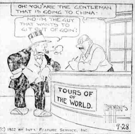
© 1922 BY INTL. FEATURE SERVICE, INC. 9-28