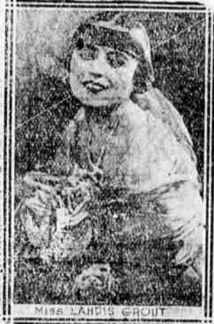
social caste than her more fortunate sister—the daughter of wealth.