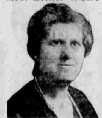
When You Have a Cough or Lose Weight and Appetite Take This Advice

Discovery' and began to take it Hefore I had used all of the first bot I felt a desire for food, my cough ceased and I began to have color an tot take an interest in life. I cor tinued to take the Golden Medical Discovery till I felt strong and well. Today I am enjoying the best of Tyler Ave.