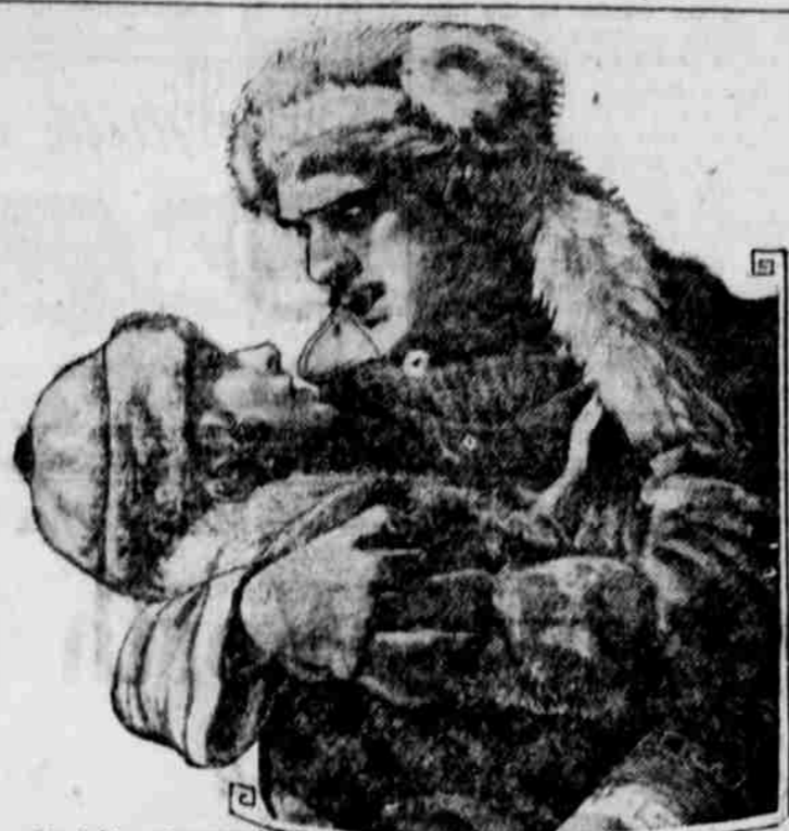
Teddie Gerard and Boris Karloff in "The Cave Girl"

Wonderful scenic background, action of tense thrills, moments of heart breaking suspense and a girl of primitive charm are the ingredients of "The Cave Girl," which is being shown at the Rialto theatre.