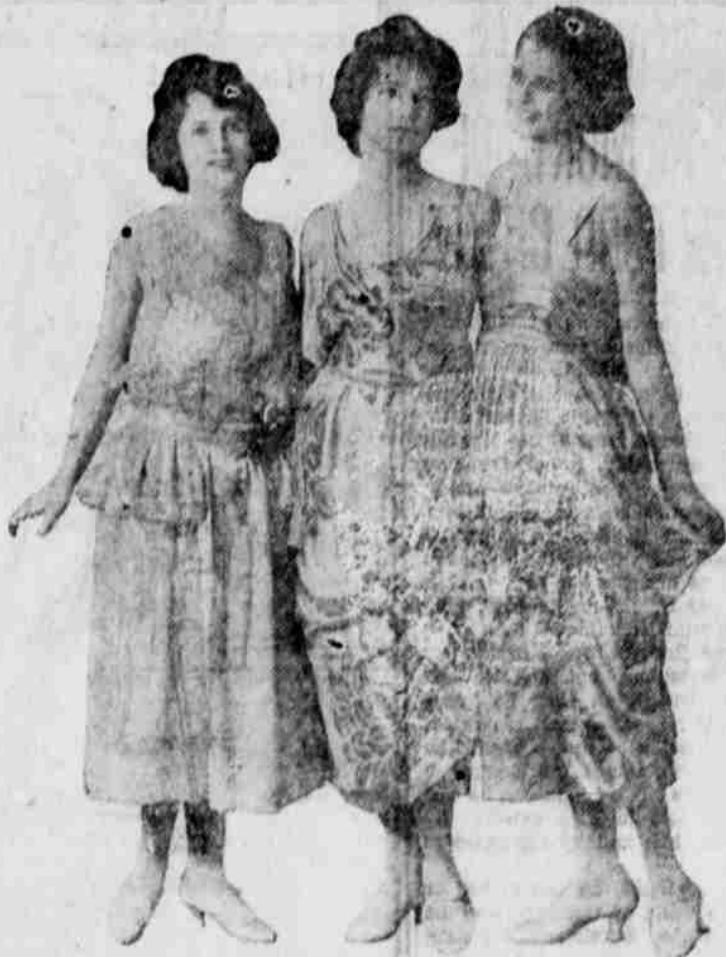
Scene from "Irene," at the Page theatre, Tuesday, April 11th.