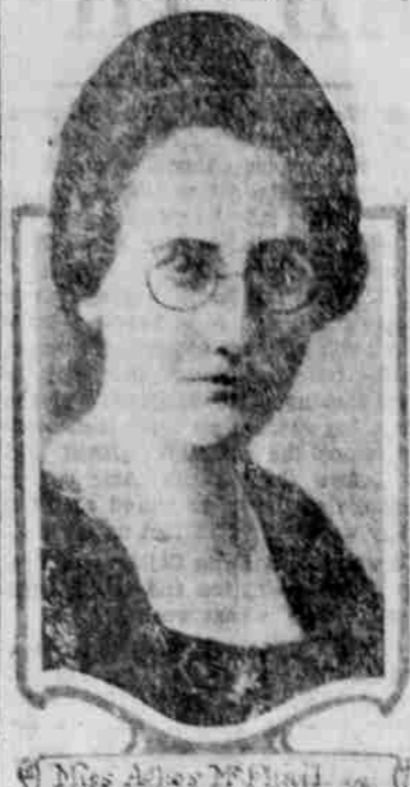
Miss Agnes McPhail was elected to the Canadian House of Commons in the federal election. She will represent the constituency of Southeast Grey (Ontario) as a progressive.