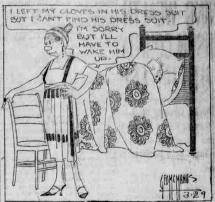
© 1922 BY INT'L FEATURE SERVICE - INC.