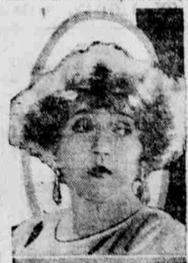
MAE MURRAY sive, dashing creature, heroine of "Peacock Alley," one of the most sumptuously staged and produced pictures Metro has turned out, and that remembering "The Four Horsemen."

The Glorious Fool, Page A delightful comedy from the pen of Mary Roberts Rinehart, "The Glorious Fool," will be presented at the Page theatre, for two days, beginning tomorrow matinee. Helene Chadwick and Richard Dix are the feature players. This youthful pair first became famous as an acting duo in "Dancerous Curve Ahead," in which they won the acclaim of critics as the exemplification of wholesome American charm and spirit.