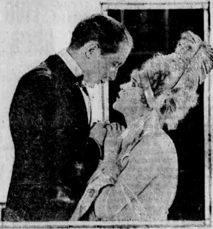
MAE MURRAY in a scene from "PEACOCK ALLEY"

Gorgeous—that's the adjective. "Peacock Alley"—that's the picture. By way of criticism I need only quote one of the screen-show titles: "Cleo, the beautiful, famed like a radiant jewel." Mae Murray is the star. Once you remember, she was "The Gilded Lady." Now she is the flaming star, the radiant jewel, the dancing darling, Cleo. "Peacock Alley" must be placed well in the front rank of the best recent productions on account of the lavishness of production, the interesting scenes from the dancer's life in Paris and New York. The beauty and ability of the star herself, the general excellence of the acting and particularly on account of the use of colors in the presentation of the introductory scenes.