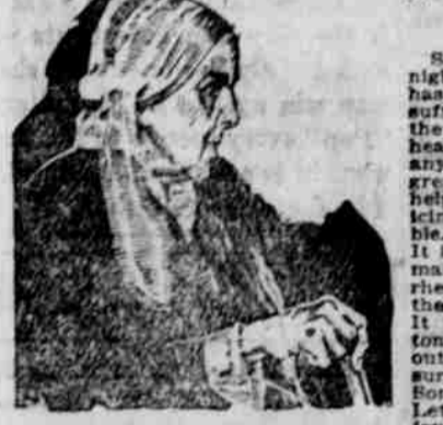
How glorious you will feel, mother, when your rheumatism is all gone. Let S. S. S. do it. It will build you up!

The base of the tiara is of fine gilt covered with silver work, and the three superimposed crowns each consists of an extremely light gold band set with jewels and studded with two rows of pearls, of which there are ninety in each row making a total of 540.