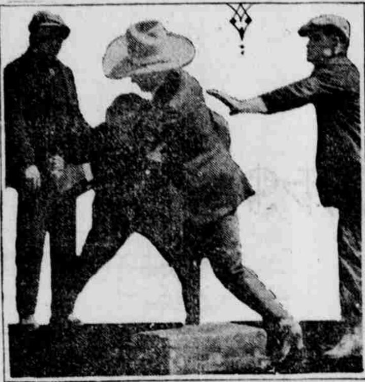
"THE BIG TOWN ROUND-UP" WILLIAM FOX PRODUCTION

The appearance of Tom Mix in a new picture, "The Big Town Round-Up," which opened yesterday at the Rialto theatre, is likely to be voted the most satisfying play in which he has appeared on the screen.