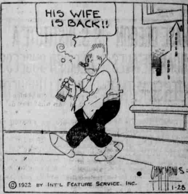
© 1922 BY INT'L FEATURE SERVICE, INC.