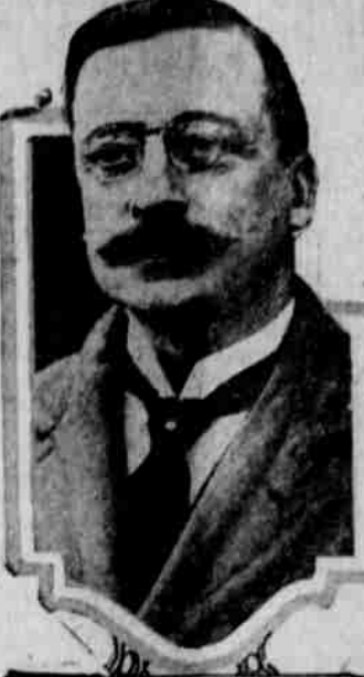
Arthur Griffith, founder of Sinn Fein

Arthur Griffith, founder of Sinn Fein who was recently elected president of Ireland by Dail Eireann (the Sinn Fein parliament). Griffith succeeds Eamonn de Valera, who resigned because the Irish peace treaty was ratified by the Dail.