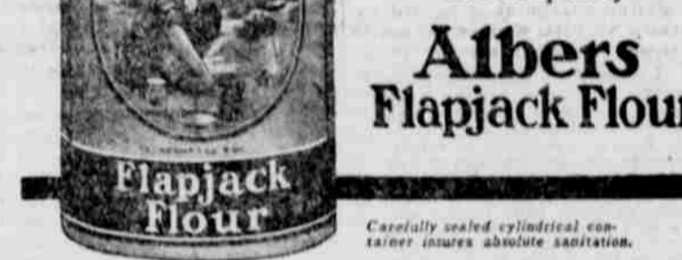
Carefully sealed cylindrical container insures absolute sanitation.

for the ever growing popularity of Albers Flapjack Flour. Makes light, tasty hot-cakes. Order a Package Your Grocer Recommends Albers quality