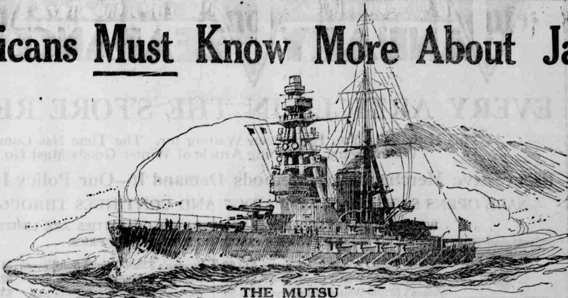
THE MUTSU Japan's newest and greatest battleship, regarded as the popular symbol of Japanese naval progress and aspirations. The pride of Japanese naval architects. Reported to have been built largely by the pennies of millions of Japanese children and the voluntary sacrifice of Japanese laborers. Japan is permitted to keep this battleship when the plan of naval reduction is carried into effect.