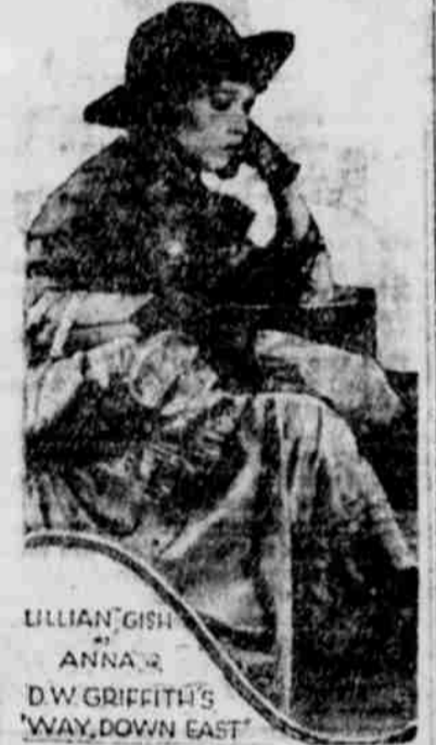
LILLIAN GISH ANNA D.W. GRIFFITH'S "WAY DOWN EAST"

David W. Griffith's notable contribution to the art of motion photography, "Way Down East," with Lillian Gish, Richard Barthelme, Mary Hay, Earl Metcosh, Lowell Sherman and others in the leading roles, reaches the last