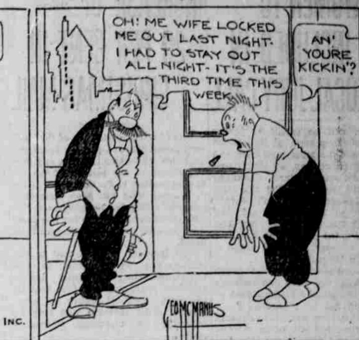
© 1921 BY INTL. FEATURE SERVICE, INC.