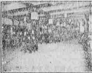
POPULAR SPACIOUS LOBBY

Make The Oregon Your Hotel WHEN IN PORTLAND