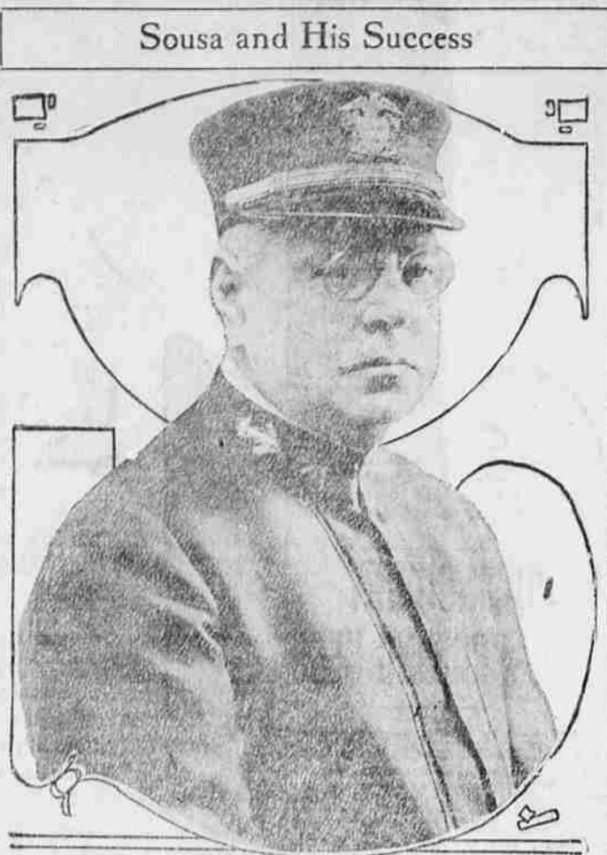
Sousa and His Success