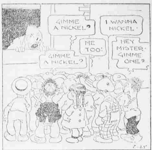
© 1921 BY DITZ FEATURES SERVICE, INC.