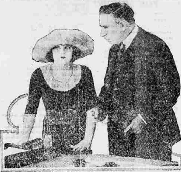
VIOLA DANA in "THERE ARE NO VILLAINS"