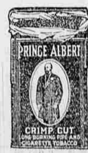
Copyright 1921 by R. J. Reynolds Tobacco Co., Winston-Salem, N. C.