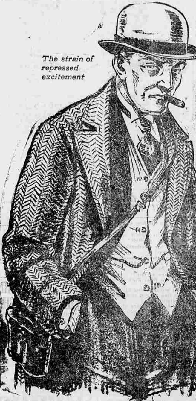
The strain of repressed excitement