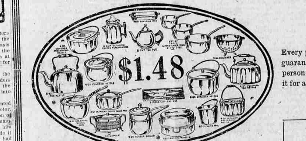
Any Piece in This Lot While They Last $1.48 Each. Regular $2.00 to $4.50 Values.

Sale Starts at Exactly 9 a. m. FRIDAY Oct. 14th