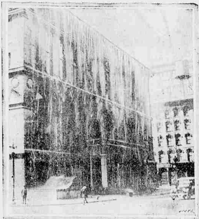
A veritable veil of water can be formed from the roof of the Chicago Public Library to the streets, serving as a protection in case of nearby fire. The water effectually screens the building from flames, heat and smoke, in case of fire in adjoining structures.

Station to see this valuable new fruit this week. As the crop on this tree must be harvested next Monday those interested in the matter are urgently requested to visit the station on Saturday, October 8th.