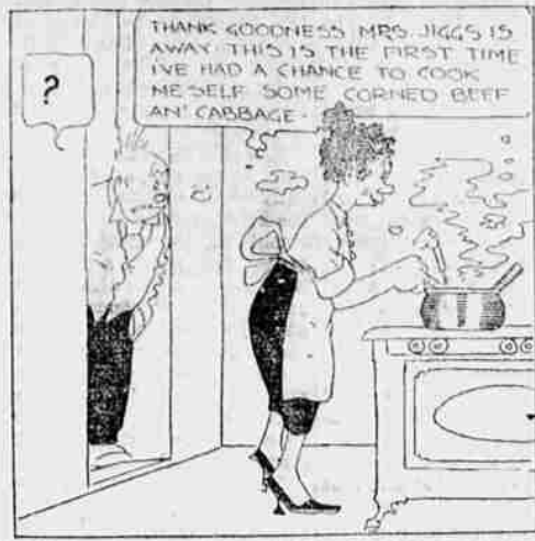
THANK GOODNESS MRS. JIGGS IS AWAY THIS IS THE FIRST TIME IVE HAD A CHANCE TO COOK MYSELF SOME CORNED BEEF AND CABBAGE.