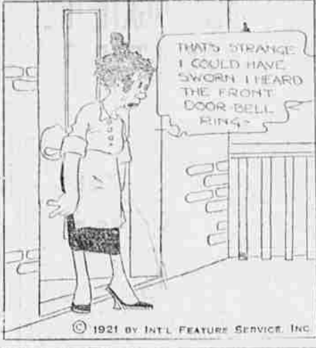
THATS STRANGE I COULD HAVE SWORN I HEARD THE FRONT DOOR BELL RING.