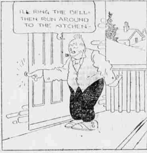
ILL RING THE BELL THEN RUN AROUND TO THE KITCHEN.