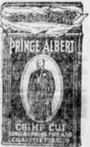
Copyright 1921 by H. J. Reynolds Tobacco Co., Winston-Salem, N. C.