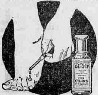
Make Your Feet Happy! Remove Those Corns With "Gets-It."

First Stops All Pain—Then Peels the Corn Off Don't try to fix tort on corn tortured feet. Get rid of your corns. If you have