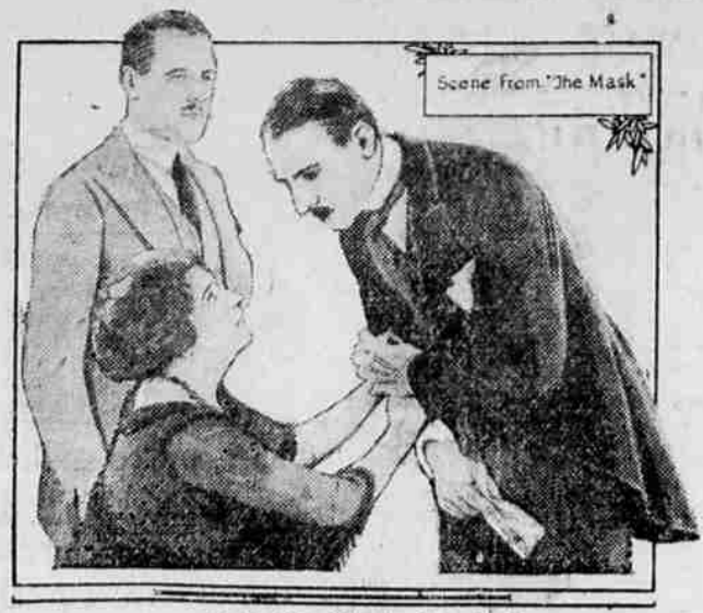
At the Page Theatre This Week.

Doesn't hurt a bit! Drop a little "Frezzone" on an aching corn, instantly that corn stops burning, then shortly you lift it right off with fingers. Truly! Your druggist sells a tiny bottle of "Frezzone" for a few cents, sufficient to remove every hard corn, soft corn, or corn between the toes, and the calluses, without soreness or irritation.