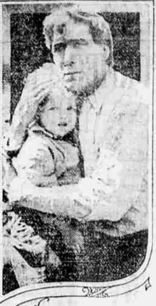
Some day when he has grown tired of making films, he intends to spend all his time writing stories for the kiddies he loves so well.