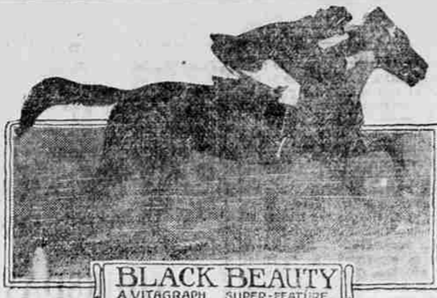
BLACK BEAUTY AVITAGRAPH SUPER-FEATURE