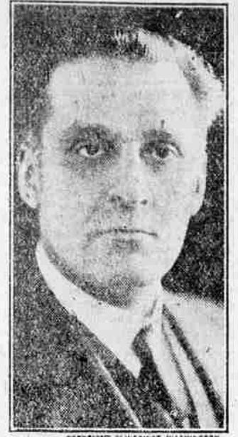
Prince Antoine Bibesco, the new Roumanian Minister to Washington, is very much of a live wire in appearance, talk and action. He already has had considerable diplomatic experience in Paris, Vienna, Brussels and London. The Prince is the son-in-law of ex-Premier Asquith of England.