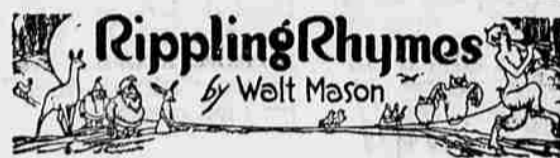
Rippling Rhymes by Walt Mason THE PRICELESS THIRST.

But the need is urgent now. The country is thoroughly nationalized. The new President is a former member of the senate, familiar with the senates' traditions and habits, and he has an absolute and unprecedented political control in both houses. In urging greater authority for cabinet members, larger responsibility and more freedom of action, allowing them active participation in the government, whenever important matters within their departments are under consideration would be in harmony with the entire reconstructive program.