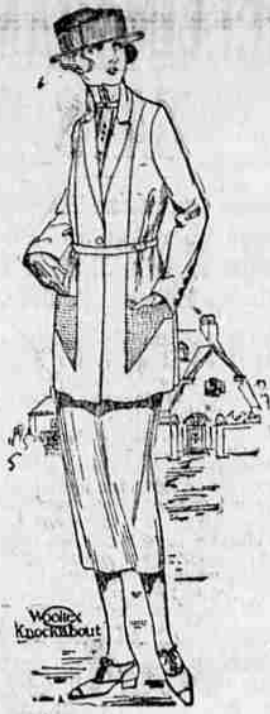
A narrow silk stitched tuck on either side of the back and interesting silk stitched pockets are the features of this Knockabout suit.