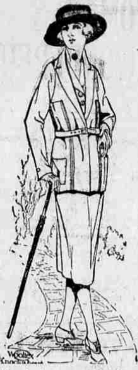
There's just enough trimming on this Knockabout suit to make it interesting. Note the semi-yoke effect and the fine big pockets.