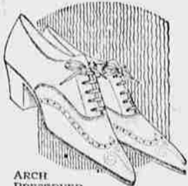
ARCH PRESERVER SHOE