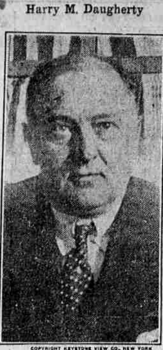
Frequently mentioned for a place in the Harding cabinet.