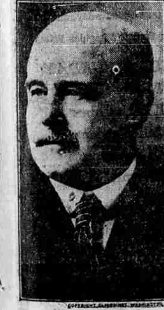
William B. McKinley, Representative from Illinois, who will enter the Senate on March 4th.