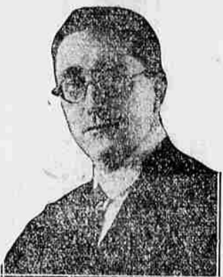
PAUL IRIBE, Noted Artist, Now Designing Settings for Paramount Pictures.