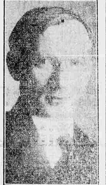
Meyer London, the only Socialist elected this year to the U. S. House of Representatives.