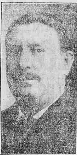
Re-elected Governor of Colorado