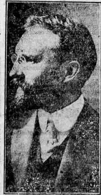
Senator George Sutherland, of Utah, is a possibility for the Attorney Generalship in Harding's cabinet.