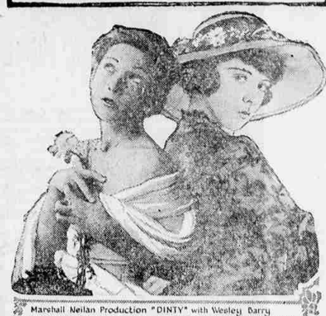
Marshall Neilan Production "DINTY" with Wesley Barry

One of the best attractions of a decade is the entertainment offering playing for the remainder of the week at the Page theatre. It is "Dinty," in which Marshall Neilan presents Wesley Barry, the freckle-faced boy actor, in the first starring vehicle of his youthful career.