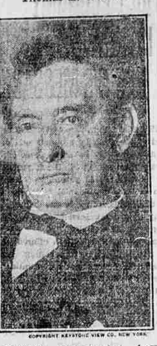
Democrat Senator—elected from Georgia.