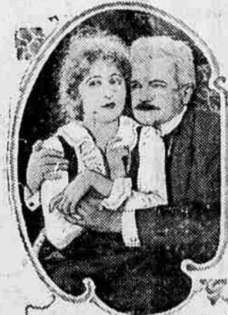
Mildred Harris Chaplin in "Old Dad"