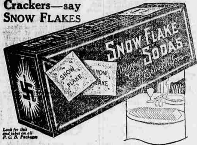
Look for this and label on all F. C. B. Packages

SOME MORE F. C. B. PRODUCTS Fig Sultana Fruit Biscuit Cream Gems Animals Wafers Vanilla Wafers Assorted Cakes Peanut Wafers Oatmeal Crackers Peanut Wafers