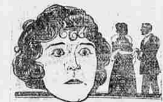
HIS WIFE Selfish, Privolous—Loving Another!