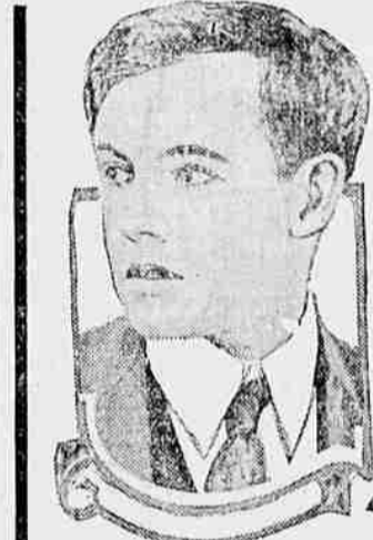
A Rip-Roaring Double-Headed Whirlwind of Laughs—

Don't Miss NOW Don't Miss It. Showing LAST TIME TONIGHT