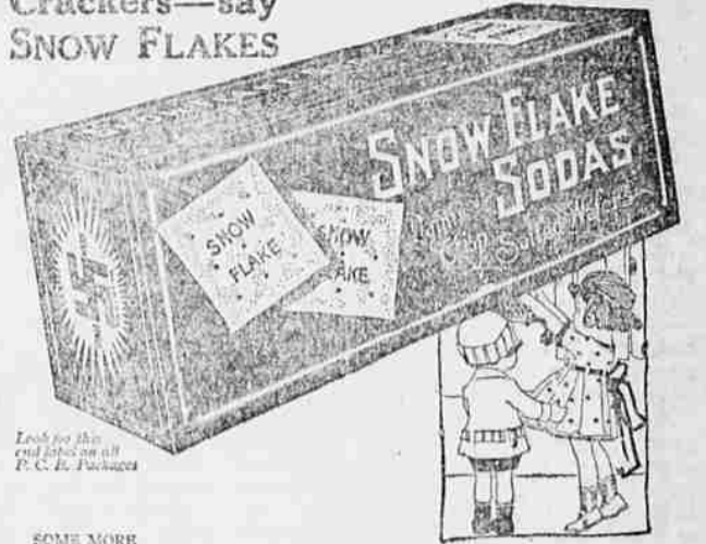
Look for this red label on all P. C. B. Packages

SOME MORE P. C. B. PRODUCTS Available: Lactic Short Bread, Arrowroot Biscuit, Lactic Tarts, Chocolate Lollies, P. B. Sodas, Malted Cocoa Sandwiches, Long Branch Soften-Flakes, Oatmeal Crackers, Peasants & Peasants Wafers