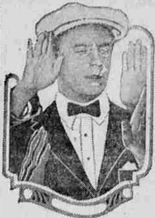
WALLACE REID Hawthorne of the U.S.A.